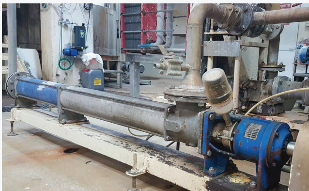
PC pump | Mineral Industry